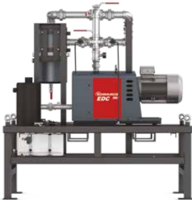
EXDM 1 Filter System

Not just pumps but complete vacuum solutions