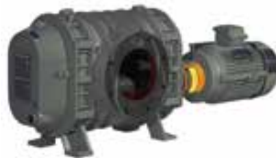
Stokes 6" Mechanical Booster Pump