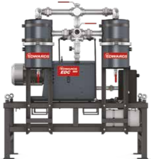
EXDM 2 Filter System